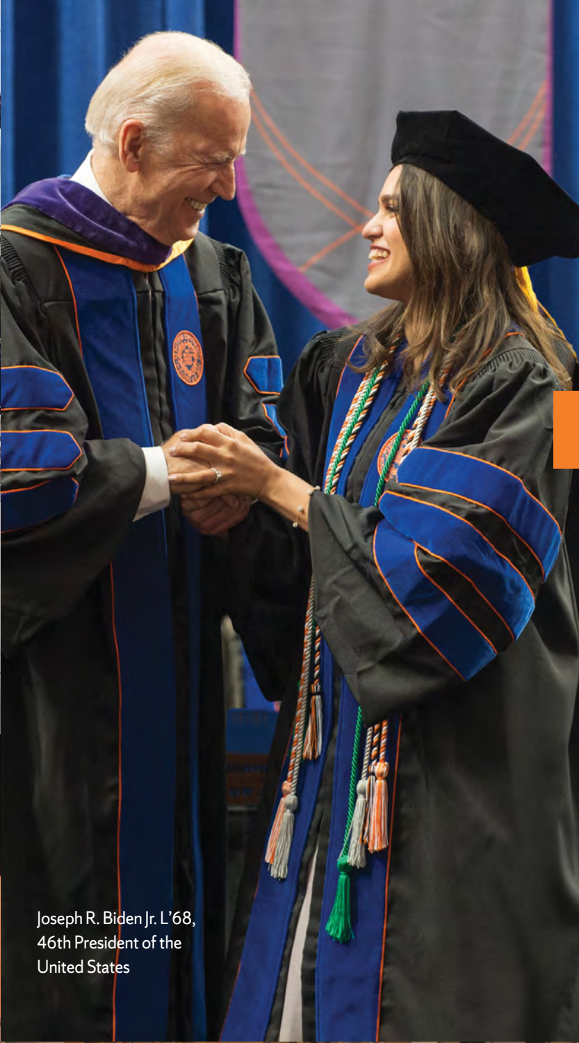
Joseph R. Biden Jr. L’68, 46th President of the United States

The Nation’s First Online Joint J.D./M.B.A Our groundbreaking online joint J.D./M.B.A. combines the College of Law’s online JDi program with the Whitman School of Management’s highly ranked online Master in Business Administration program.